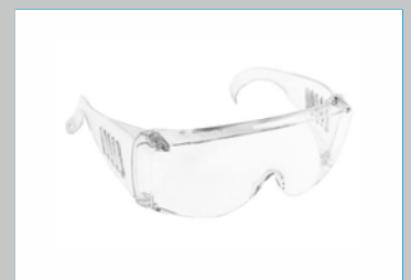
Eye Protection Goggles

Note: Product images shown for representative purposes.