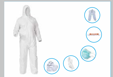
Personal Protection Equipment