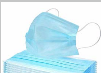
3 Ply Face Masks