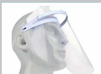
Protective Face Shield