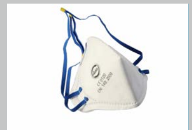
Disposable Particulate Respirator