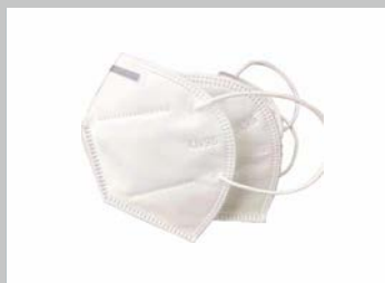
KN 95 Masks