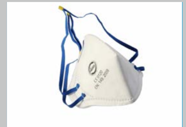
Disposable Particulate Respirator