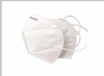
KN 95 Masks