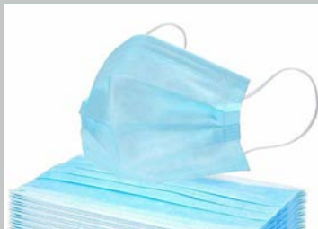
3 Ply Face Masks