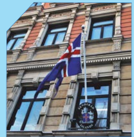
Embassies & Consulates