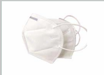
KN 95 Masks