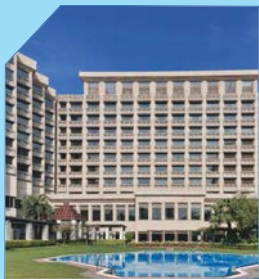
Hotels & Resorts