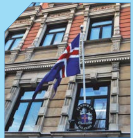
Embassies & Consulates