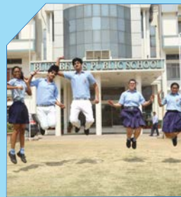
Schools & Colleges