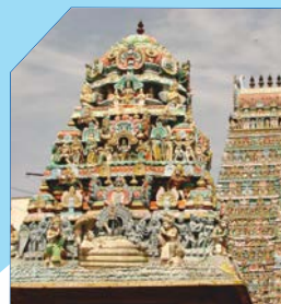
Places of Worship