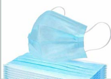
3 Ply Face Masks