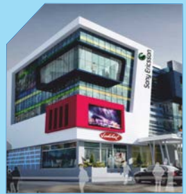
Malls & Shopping Complexes