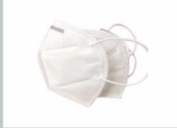
KN 95 Masks